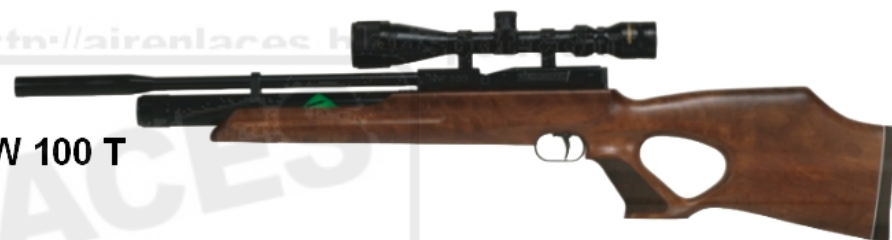
HW 100 T