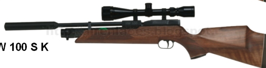
HW 100 S K