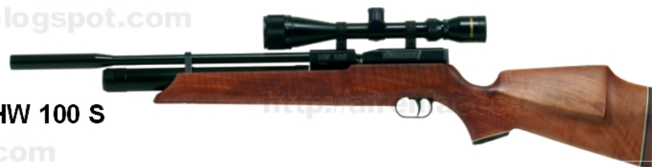
HW 100 S