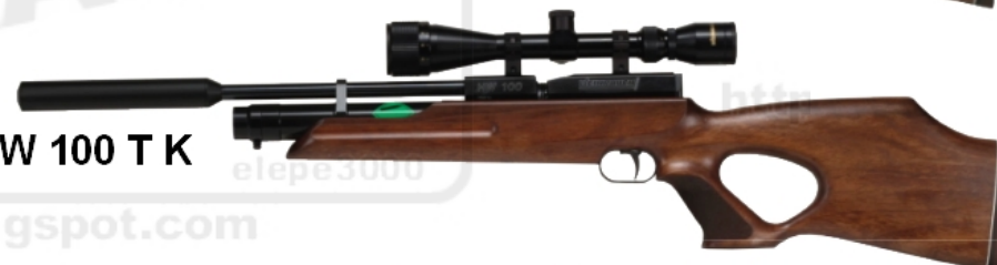
HW 100 T K