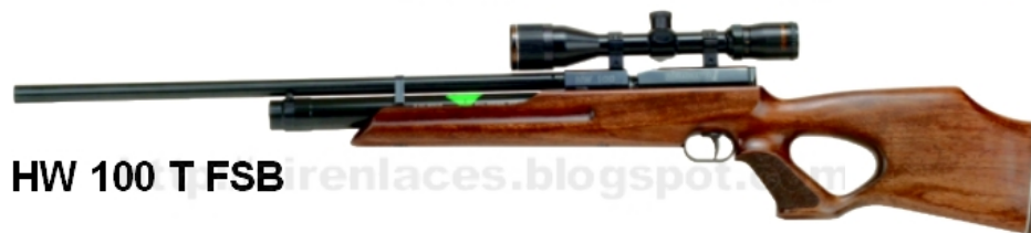
HW 100 T FSB