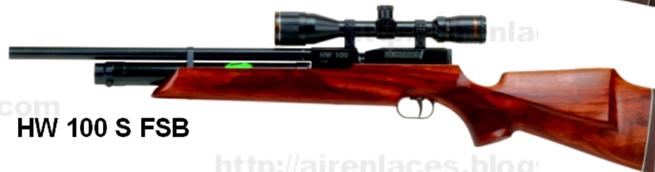
HW 100 S FSB