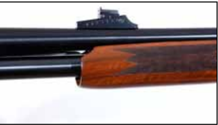
Deerslayer II Rear Sight