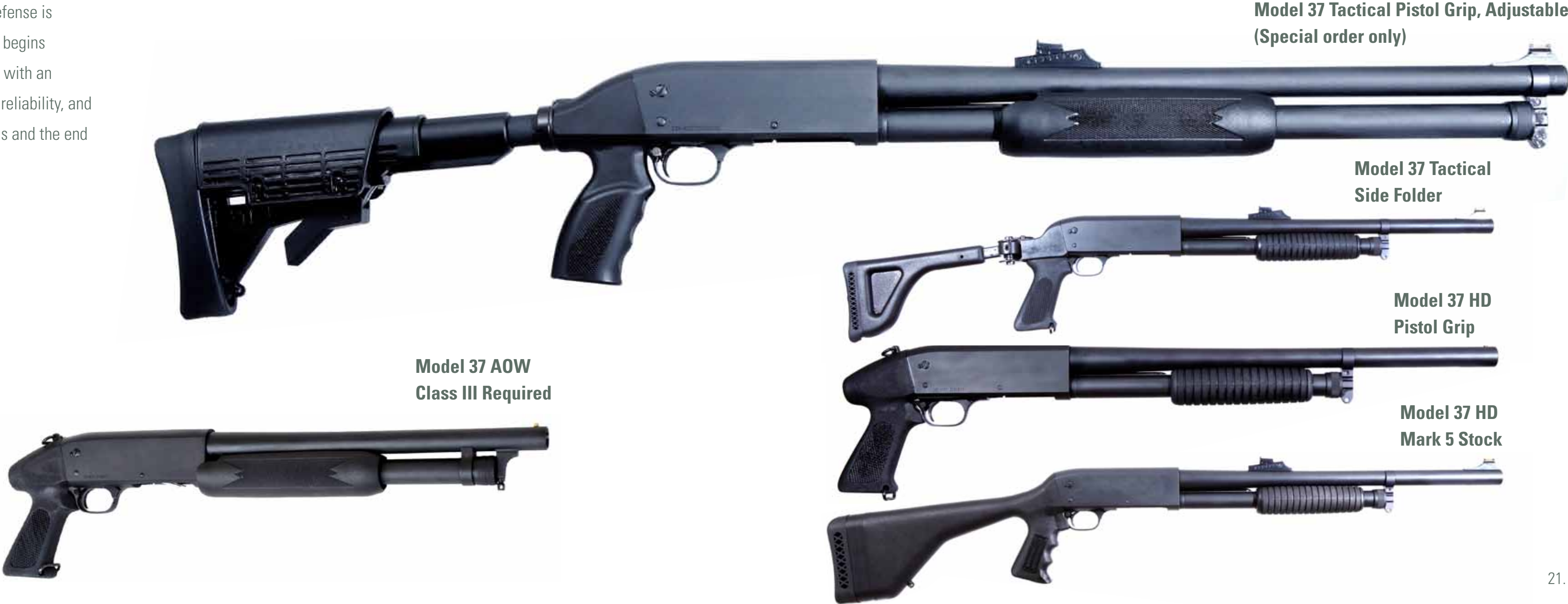
Model 37 Tactical Pistol Grip, Adjustable (Special order only)