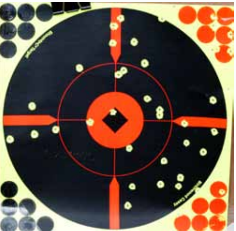
Waterfowl shot pattern