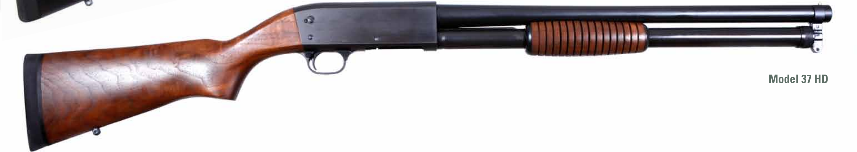
Model 37 HD