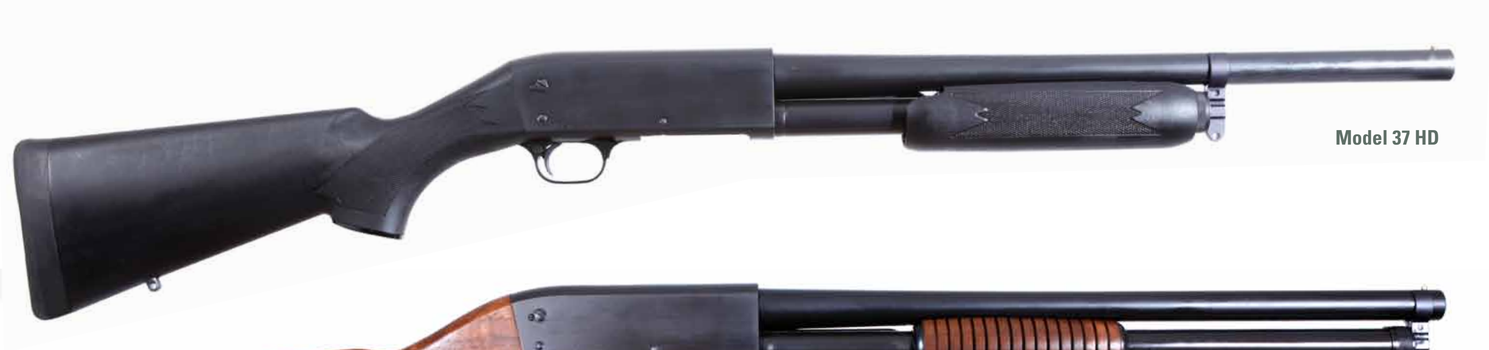
Model 37 HD