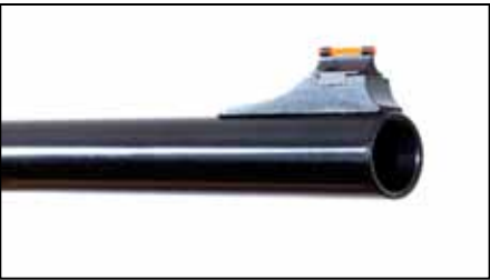
Deerslayer II Front Sight