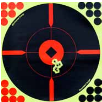
Ithaca 1911 at 15 yards.