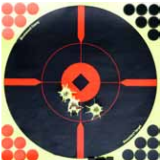
DeerSlayer shot pattern at 100 yards