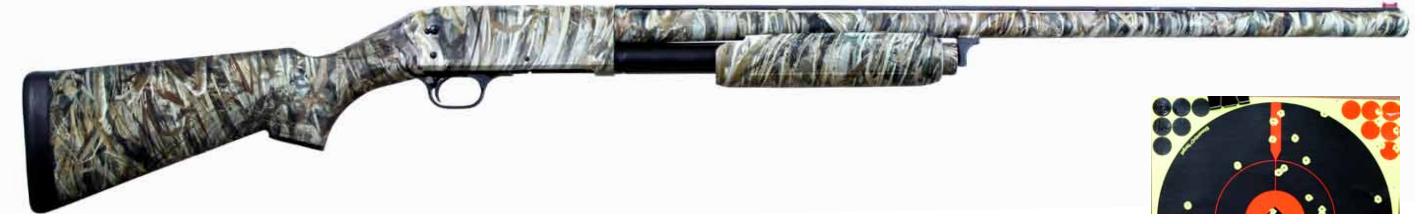
Tru-Glo front Site availabl on all models