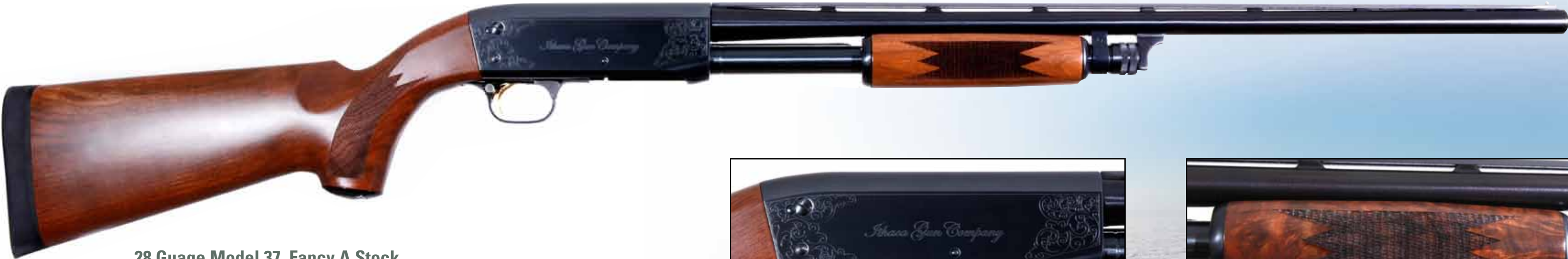
28 Guage Model 37, Fancy A Stock